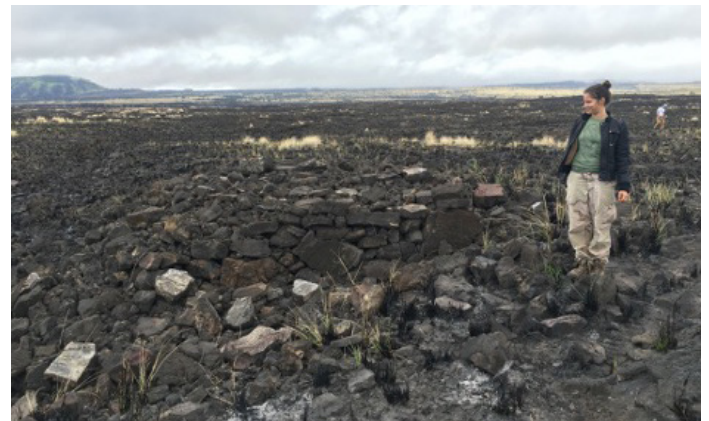
Ki'i 3: He limahana o ka Nāpu'u Conservation Project e nānā ana i ke ahu pōhaku ma kahi i pau i ke ahi uila i ka makahiki 2016 ma Pu'uwa'awa'a.

Inā 'a'ole waele 'ia nā meakanu malihini, e mau ana nā pau ahi nui ma Hawai'i nei. Me ka 'ole o nā hana pale ahi a me nā hana ho'omākaukau kinai ahi, 'o ia ho'i ka ho'emi 'ana i ka wahie, ka ho'omākaukau 'ana i nā pale ahi, a me ka mālama 'ana i nā lako kinai ahi, hiki i ke ahi lalapa ke laha aku i 'ō a i 'ane'i ma Pu'uwa'awa'a, a pau he mau kaukani 'eka i ke ahi (Ki'i 3). Hiki i ka lehulehu ke kōkua i ka pale 'ana aku i ke ahi, no ka mea, ho'omaka 'ia ka 98% o nā ahi ma Hawai'i e nā kānaka. Aia ka pono 'o ka ho'omaopopo o ka lehulehu i ka pō'ino a me ka hopena o ke ahi. A he pono nō ho'i ka hā'awi 'ia 'ana o nā lako a me ka 'ike e pale aku ai i ke ahi ma nā kaiāulu.