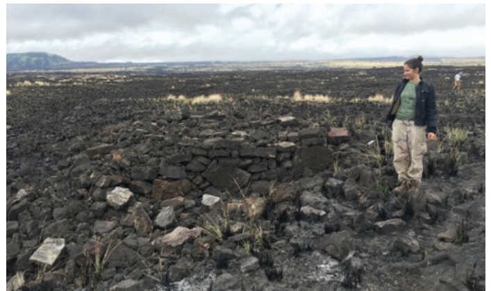
Figure 3: Nāpu'u Conservation Project staff member examines a stone structure in a recently burned area after the 2016 Lightning Fire at Pu'u Wa'awa'a.

If highly flammable non-native vegetation is not controlled, ignitions will continue to lead to large, destructive fires. Without prevention and pre-suppression measures such as reducing fuel loads, creating fuel breaks, and maintaining an appropriate equipment inventory, fires can rapidly spread through Pu'u Wa'awa'a and consume thousands of acres (Figure 3). The public can also play a role in fire prevention especially given that 98% of the fires in Hawai'i are human-caused. The public must not only be made aware of the threat and impacts of fire, but also be given the tools to prevent fires from occurring in their communities.