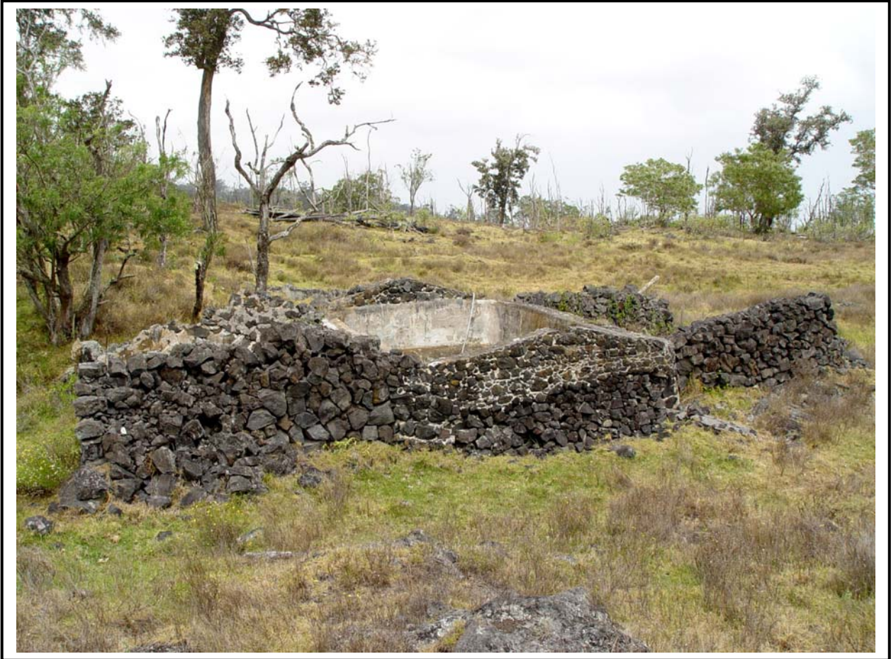
Ruins of Stone Cistern and Corral in Waiho li'ili'i Paddock (Photo No. KPA-S797)